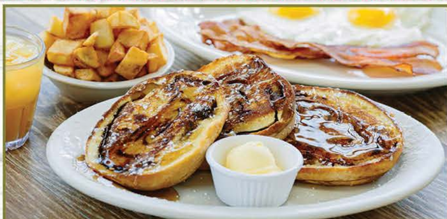
All Hearty Farmhouse Specials are Served with Warm Homemade Syrup, Sprinkled with Powdered Sugar and Sweet Cream Butter.

*Two Eggs Cooked To Your Liking, Bacon or Sausage, Home Fried Potatoes and served with one of the Following: